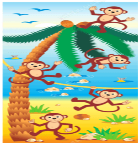
Image provided on www.superschooling.com - For personal use only - reproduction is prohibited